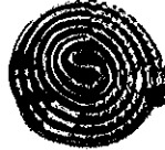
Real black licorice (or supplements with licorice extract)