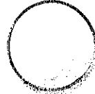
Cheese, yogurt, milk, calcium supplements, antacids with calcium