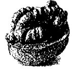
Soybean flour, walnuts

DON'T MIX WITH ACE inhibitors such as captopril (Capoten), enalapril (Vasotec), and lisinopril (Prinivil, Zestril), used to lower blood pressure or treat heart failure. And avoid mixing with some diuretics, such as triamterene (Dyrenium), used to reduce fluid retention and treat high blood pressure.