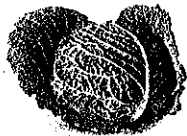
Broccoli, Brussels sprouts, cabbage, kale, spinach