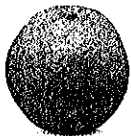
Bananas, green leafy vegetables, oranges, salt substitutes

Below, we list some common foods that could interact with your meds—and suggest how to safeguard yourself.